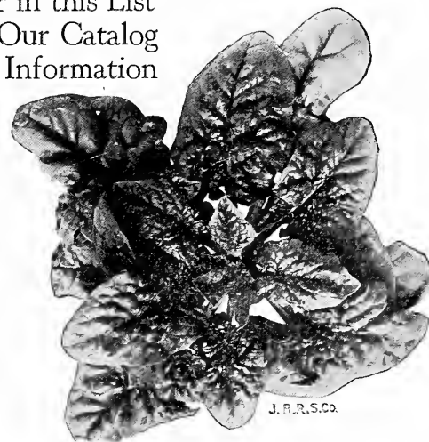
J. B. R. S. Co.

An old standard. Grand Rapids growers use this variety very largely for main crop for spring, summer and fall. Oz., 10c; 1/4 lb., 15c; 1 lb., 35c, postpaid.